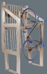
AMTRAK BIKE RACK

Your partnership with Seachrome benefits from our longtime specialization in developing the safest and most comfortable grab bars, seats, support frames, and other accessory products. Our expansive engineering and manufacturing facility boasts state-of-the-art CAD/CAM capabilities and precision metal production. Seachrome's commitment to USA-made quality and in-depth knowledge of the Americans with Disabilities Act assures that any products we manufacture for you meet the highest standards of safety, support, strength and function. Most importantly, we believe in creating lasting relationships, with a dedication to service and pride in the end results that have helped us build a worldwide reputation in custom fabrication for OEM applications.