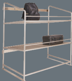
AMTRAK LUGGAGE RACK